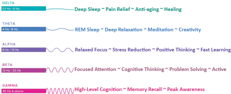
VR Reduces Pain Activity In The Brain

Our immersive & interactive guided meditation sessions synergize with binaural beats therapies to boost the effectiveness of VR.